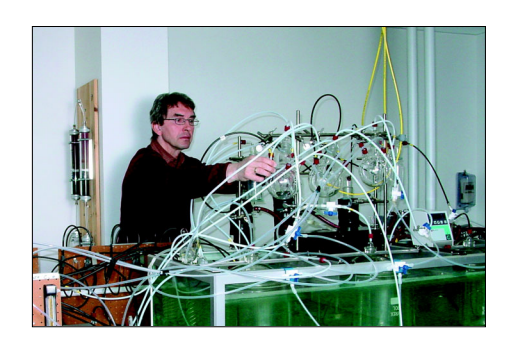
The EWO-sensors will be calibrated and tested for different environments in a climate chamber at NILU.

The EWO-sensors will provide a relatively cheap and easy way for museums as a first step to evaluate the quality of the environment they provide for organic objects. This represents a considerable step forward, since museums used to rely