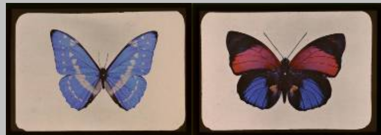
Unknown author, 1910-1920, autochrome