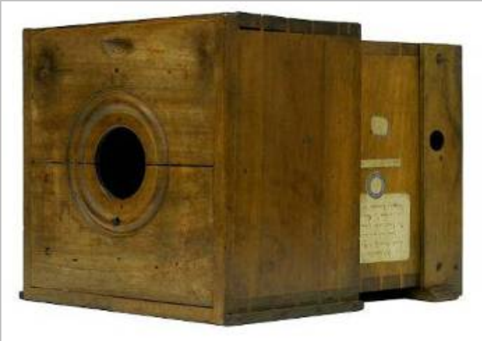
The first camera Before 1826