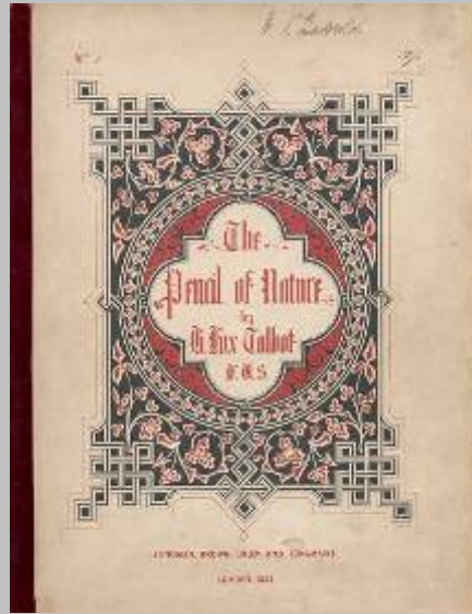
William Henry Fox Talbot The Pencil of Nature , 1844