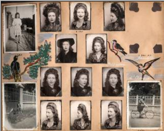
Amateur personal album, 1957