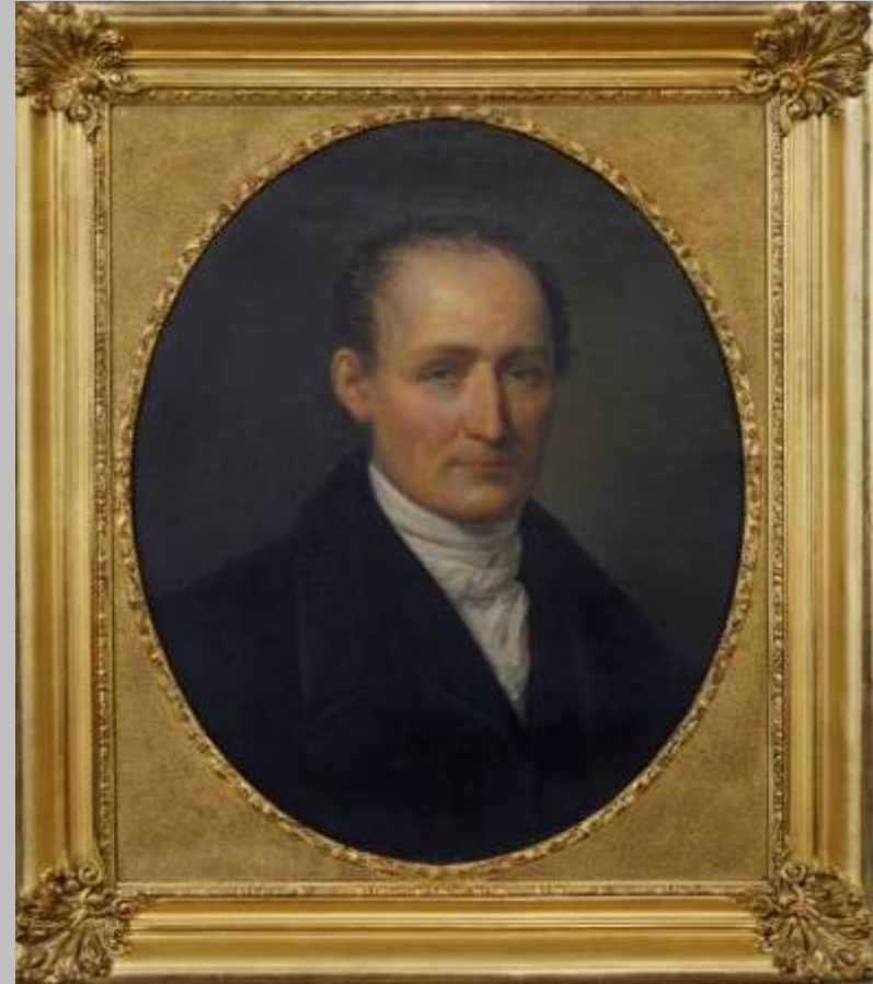
Léonard François BERGER Posthumous portrait of J.N. Niépce, 1854